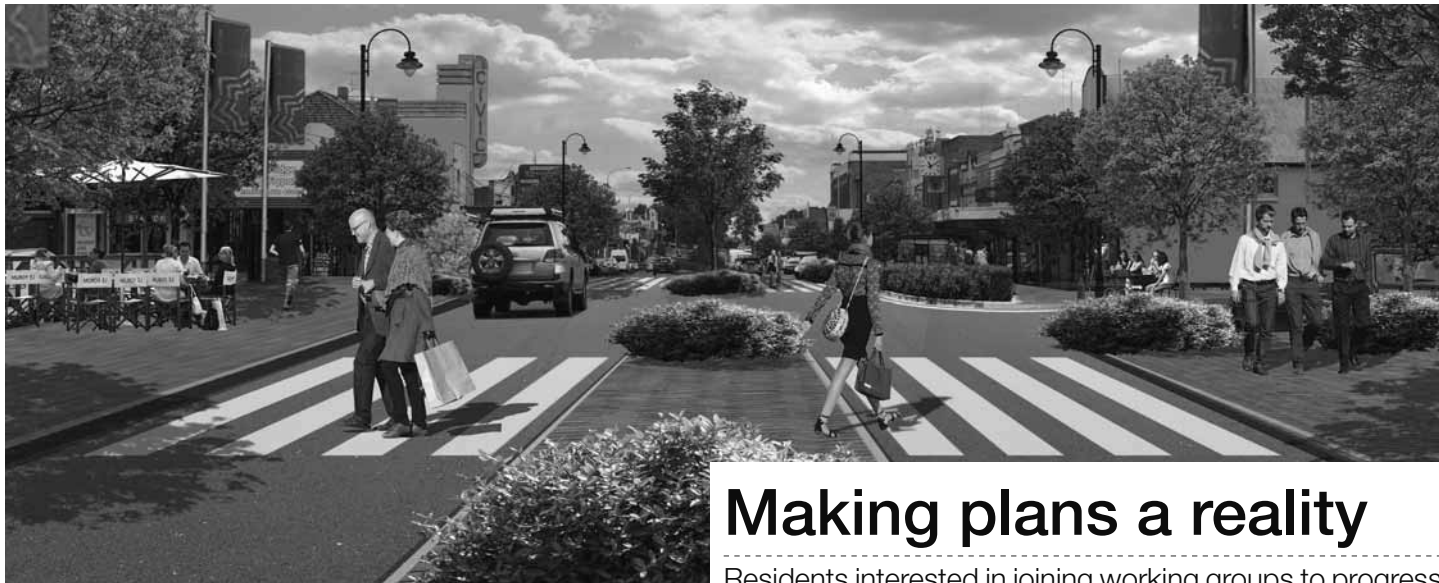
ARTIST'S IMPRESSION: Public art, landscaping, pedestrian access and slowing traffic through kerb blisters and green spaces are some of the recommendations for the revitalisation of Upper Hunter towns.