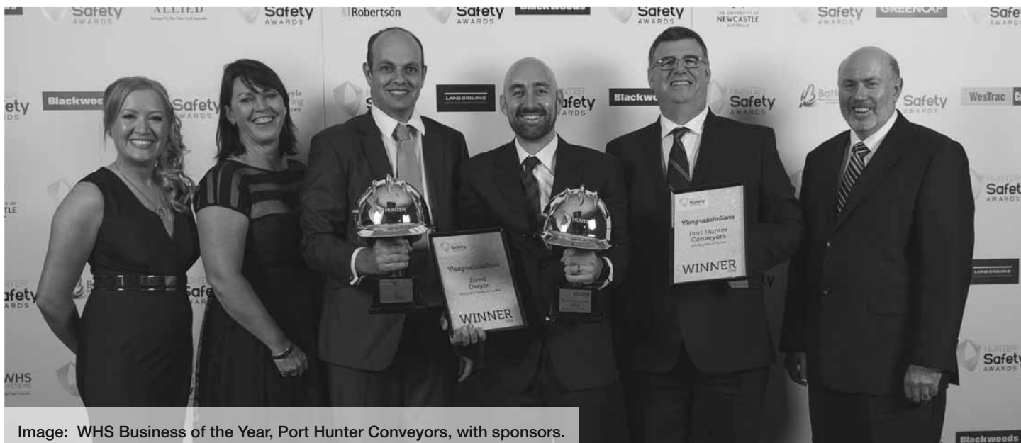
Image: WHS Business of the Year, Port Hunter Conveyors, with sponsors.

Scone's Airspeed Aviation is one of a handful of local businesses named as a finalist in the 2017 Hunter Safety Awards.