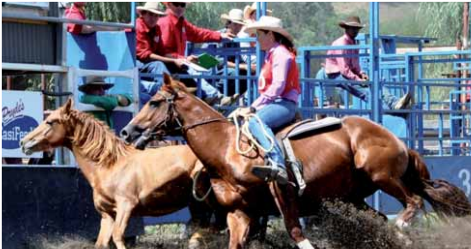
EXPERTISE: Ladies final of the Wild Horse Catch event at 2016 King of the Ranges.

Missed an issue? www.huntervalleyprinting.com.au/Pages/Entertainer.php