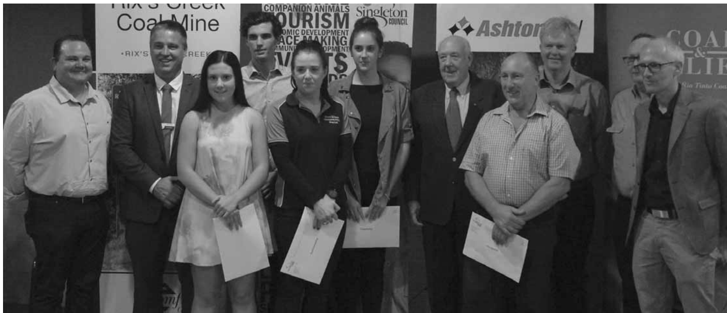
Scholarship recipients and sponsors (pictured above ) from the 2016 Mayoral Scholarship.

Local students are encouraged to apply for a share in $14,000 worth of scholarships with the 2017 Singleton Mayoral Scholarship Program.