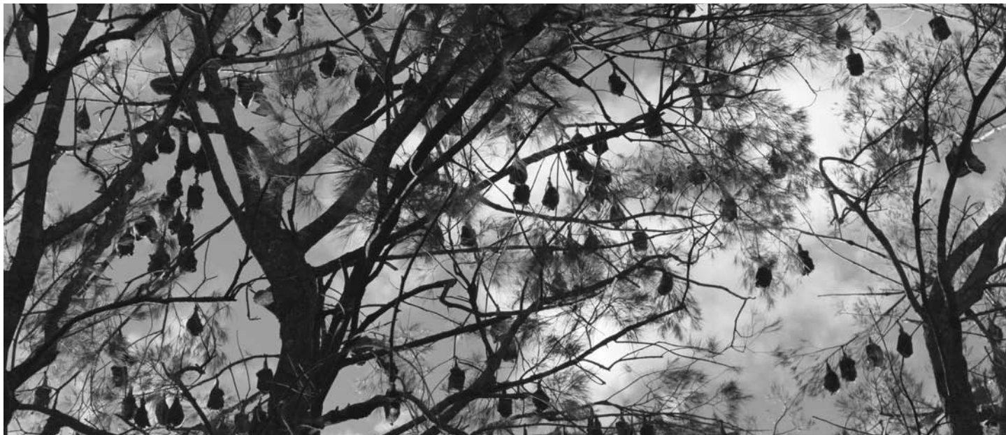
Image: From late 2014, several thousand flying-foxes have at times set up a camp in Aberdeen along a section of the Hunter River close to a campdraft area. Upper Hunter Shire Council installed signs in the area with information about safety precautions. Residents' views on the flying-foxes are being sought in order to create a camp management plan for the Shire.

In recent years, flying-foxes have established temporary camps at St Andrews Reserve, Aberdeen and other locations throughout the Upper Hunter.