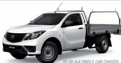
BT-50 4x4 SINGLE CAB CHASSIS

Saunders Mazda & Honda Scone carry the entire range of new Mazda & Honda vehicles.